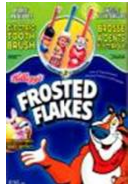
Fig. 3 “Frosted Flakes” http://www.mikesjournal.com/Kelloggs%20Frosted%20Flakes.jpg

http://images.usatoday.com/money/photos/2004/09/30/general-mills-cereal.jpg