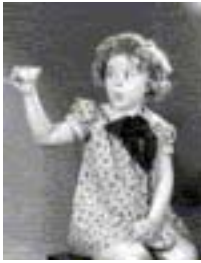
Youth brings energy.

Mentoring Program at Silicon Valley Chapter,”