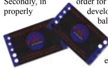
14 bottomless coffees = 1 mentoring program.

Secondly, in order for a mentoring program to properly develop it must strike the right balance between structure and flexibility. On the one hand, enough discipline needs to be exerted to ensure that regular face-to-face meetings occur (e.g., a working lunch in a suitable public venue once a month); yet the door must always be open for the spontaneous exchanges that nurture the relationship and develop trust.